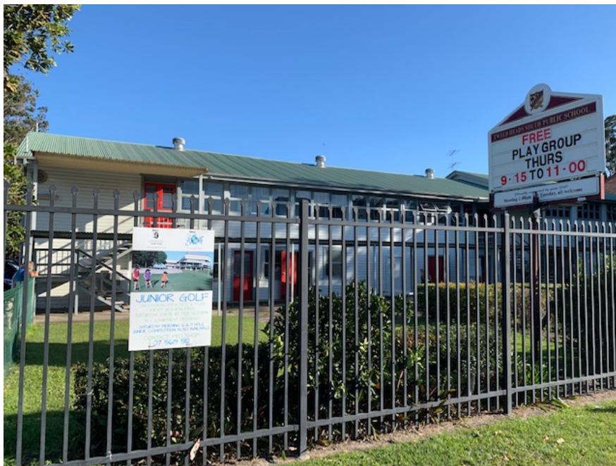
Figure 12: Building C - to be demolished