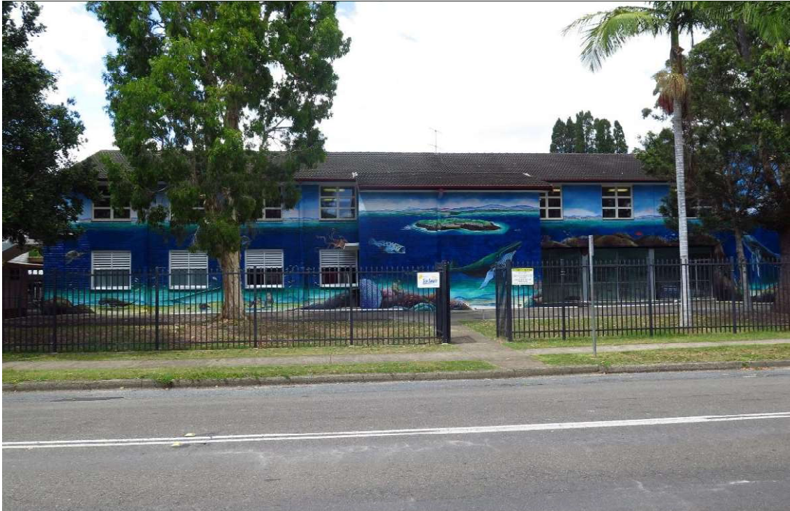
Figure 5: View of Existing Building B from Heffron Street