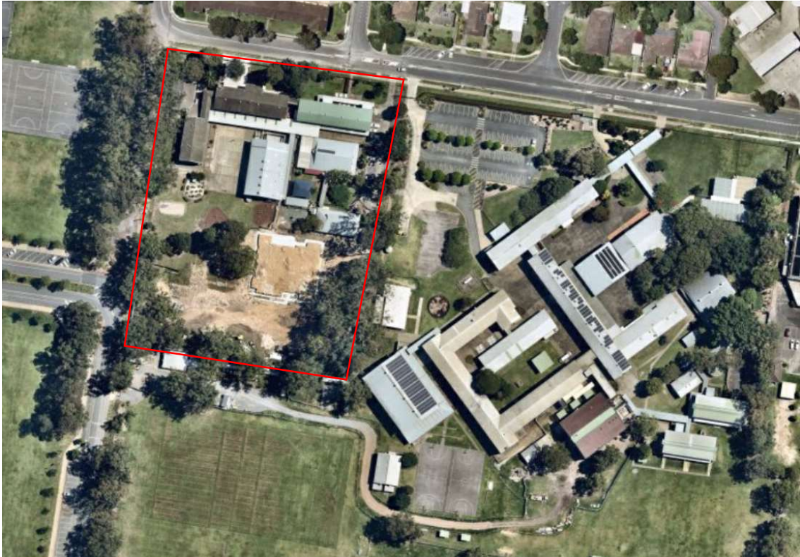
Figure 1: Tweed Heads South Public School