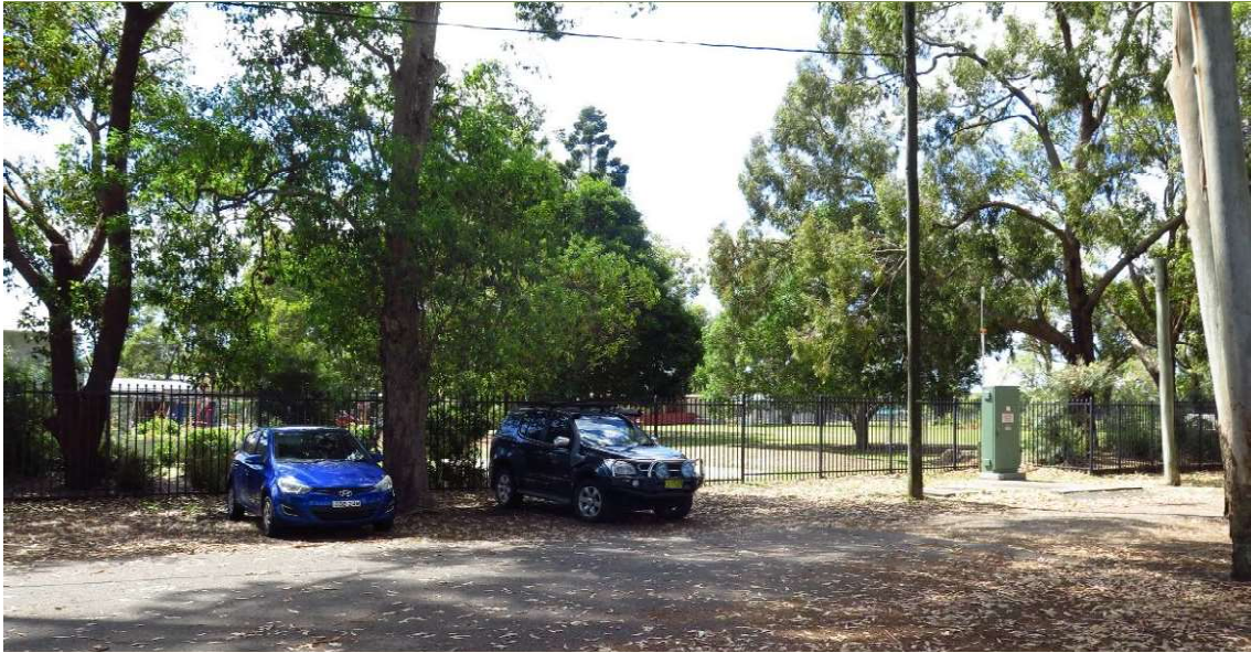
Figure 9: View from Oxley Lane of the school, including the location of proposed building (Building 1)