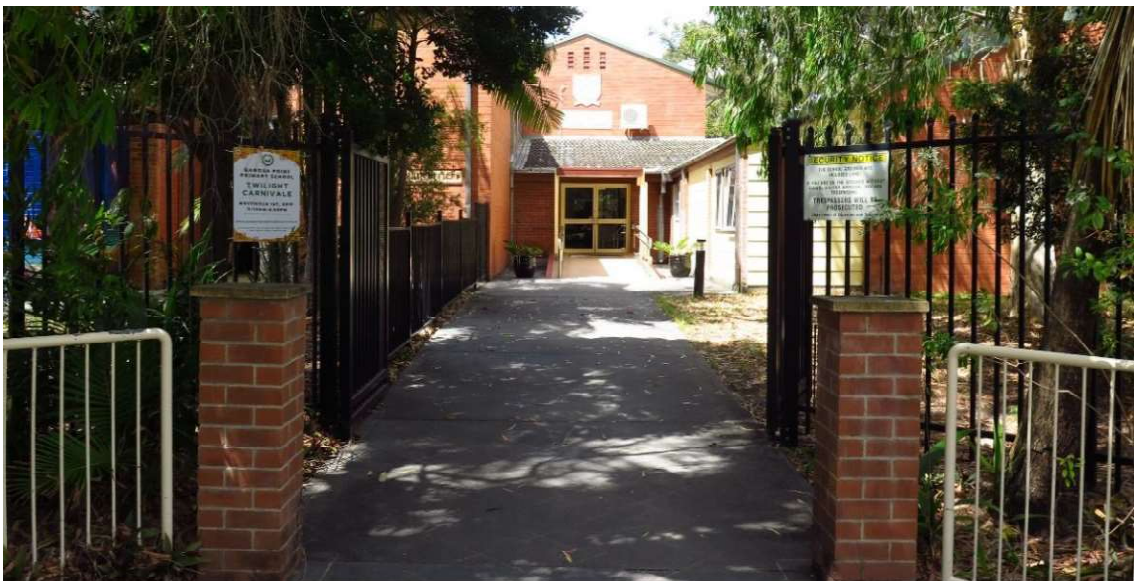
Figure 4: View of existing Building A and entry into reception/staff administration