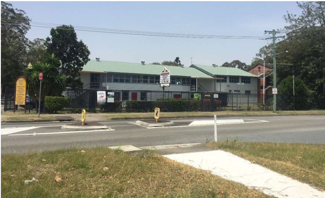
Figure 6: View of Existing Building C (green roof) from Heffron Street