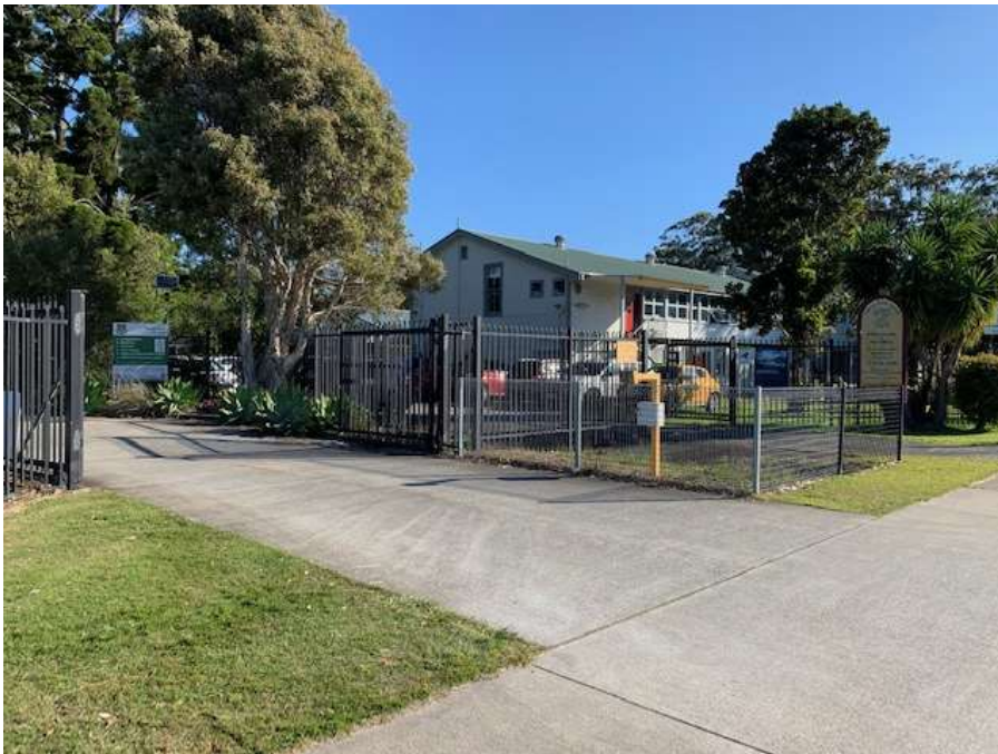
Figure 2: Existing TRHS crossover and THSPS crossover (to be removed) Building C to be demolished