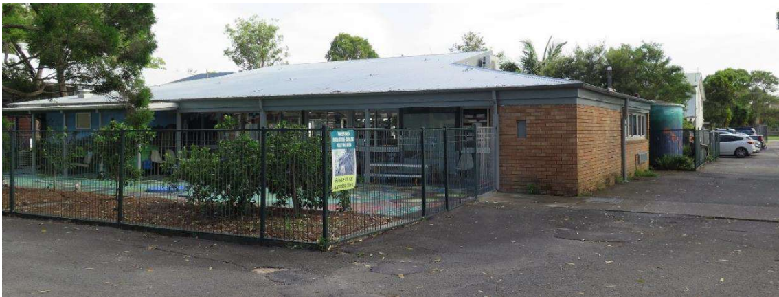
Figure 10: View of existing Building E and outdoor play area