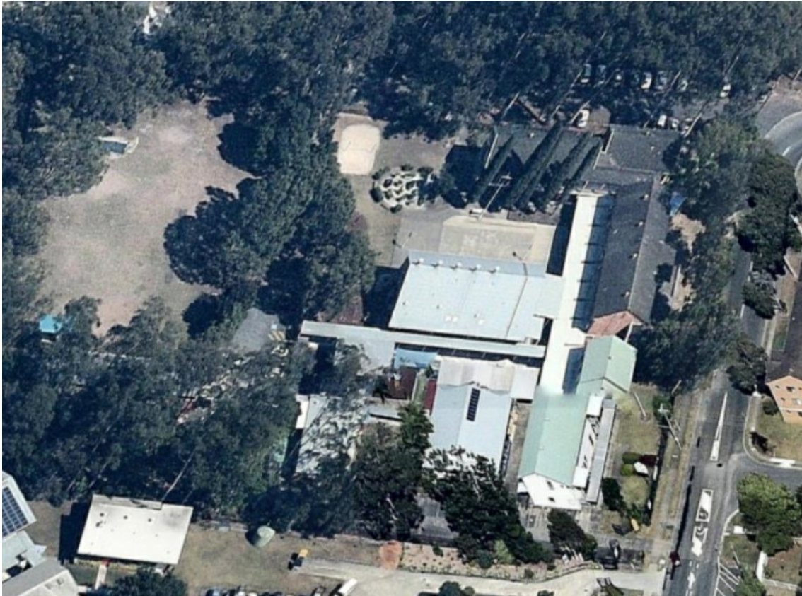
Figure 3: Existing THSPS looking West