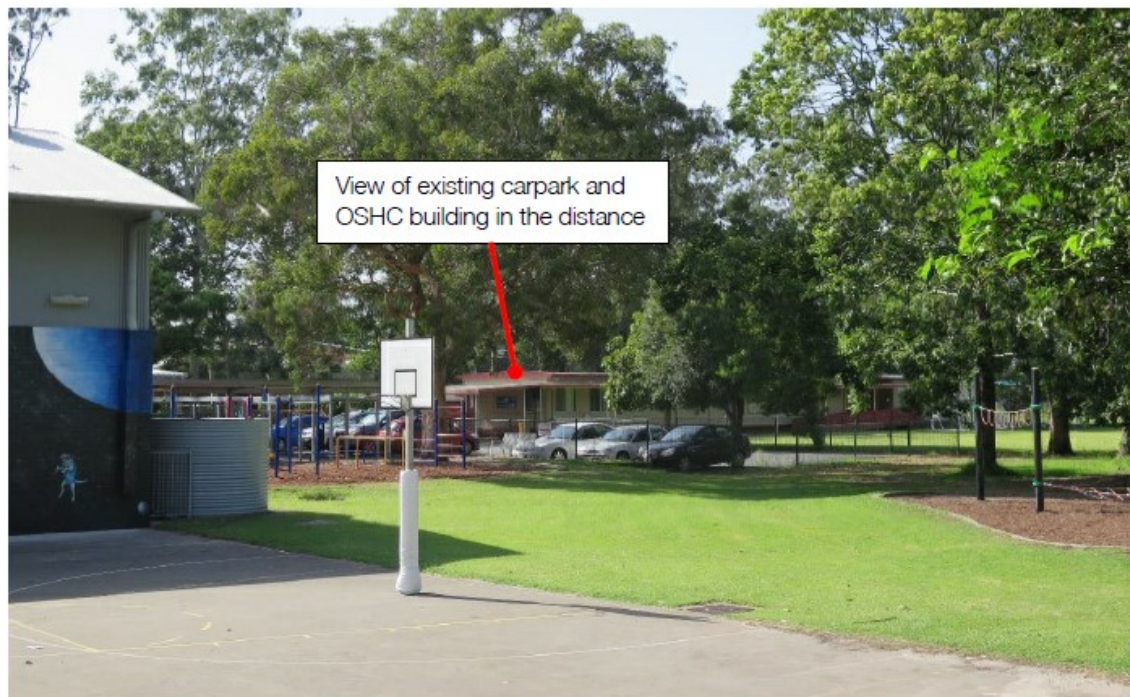
Figure 8: View of informal carparking area and OSHC building in the distance.