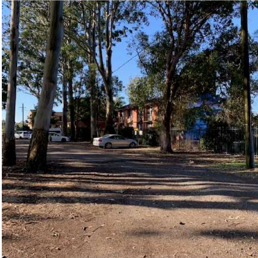
Figure 11: current informal pick up area (building A in background)